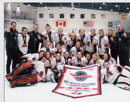
2019 FWSSC Gold Medal Champions Lloydminster PWM Steelers, Lloydminster, AB