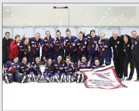
2018 FWSSC Gold Medal Champions St. Mary's Academy, Winnipeg, MB