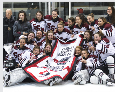
2017 FWSSC Gold Medal Champions Shattuck-St. Mary's U-19, Faribault, MN