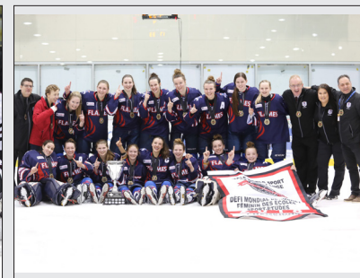
2018 FWSSC Gold Medal Champions St. Mary's Academy, Winnipeg, MB