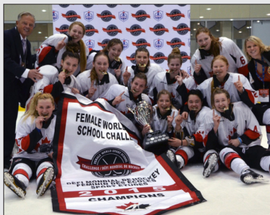
2015 FWSSC Gold Medal Champions Pursuit of Excellence Red, Kelowna BC