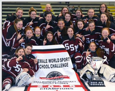
2016 FWSSC Gold Medal Champions Shattuck-St. Mary's U-19, Faribault, MN